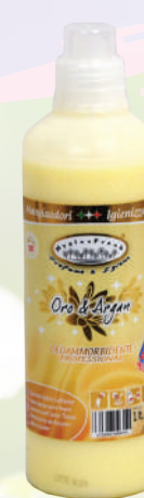
Gold & Argan