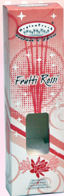
Frutti Rossi 80-093UV