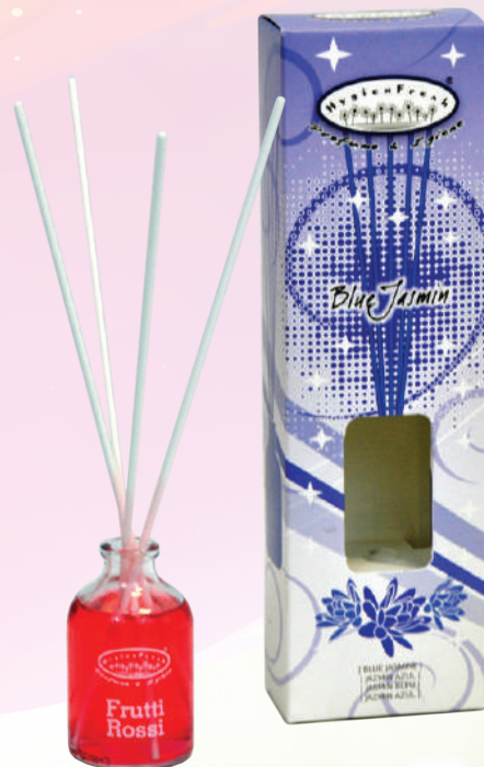
Blue Jasmin A80-096UV