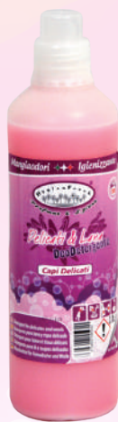
Delicates & Wool