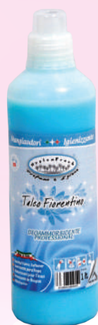
Talc of Florence